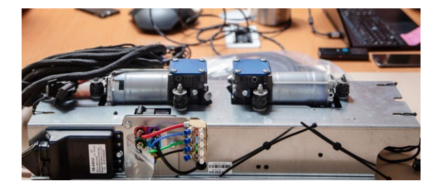
WE MAKE EVERY JOURNEY A GOOD ONE.